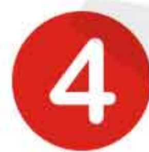
Connect VCI to device by USB cable.